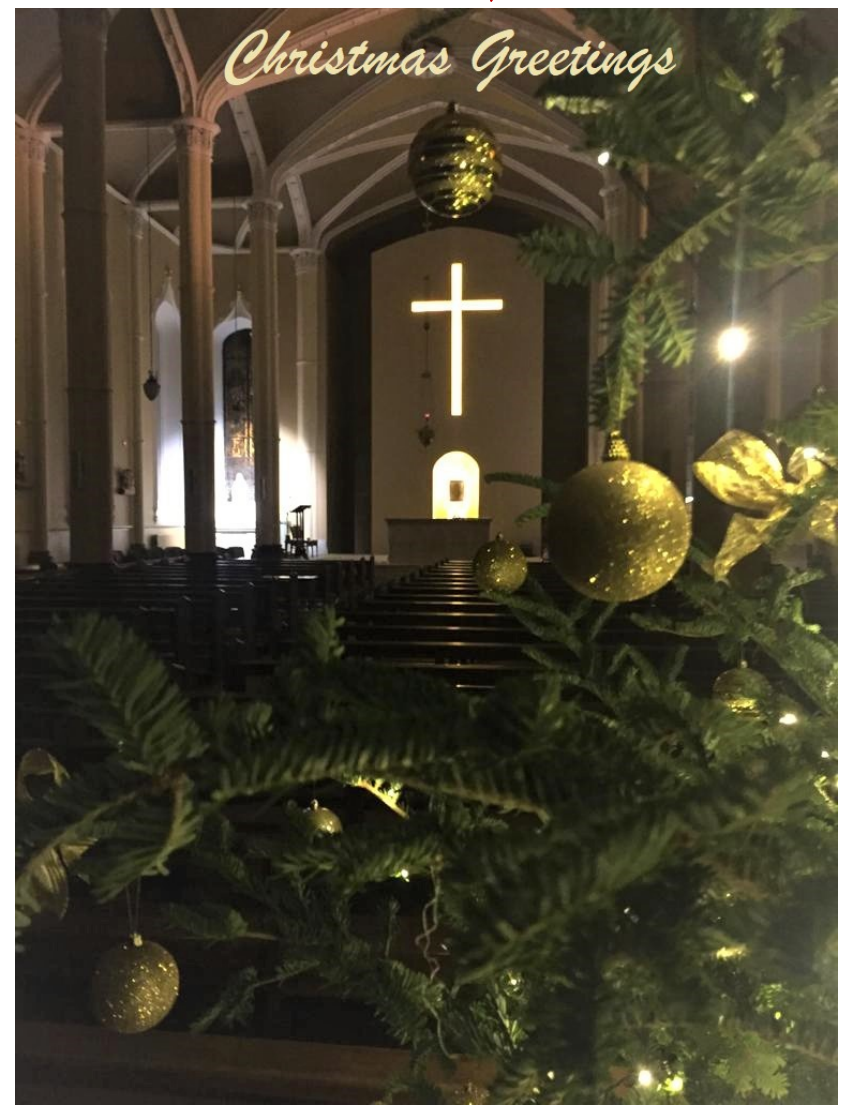
Wishing all our Parishioners a Very Happy And Peaceful Christmas